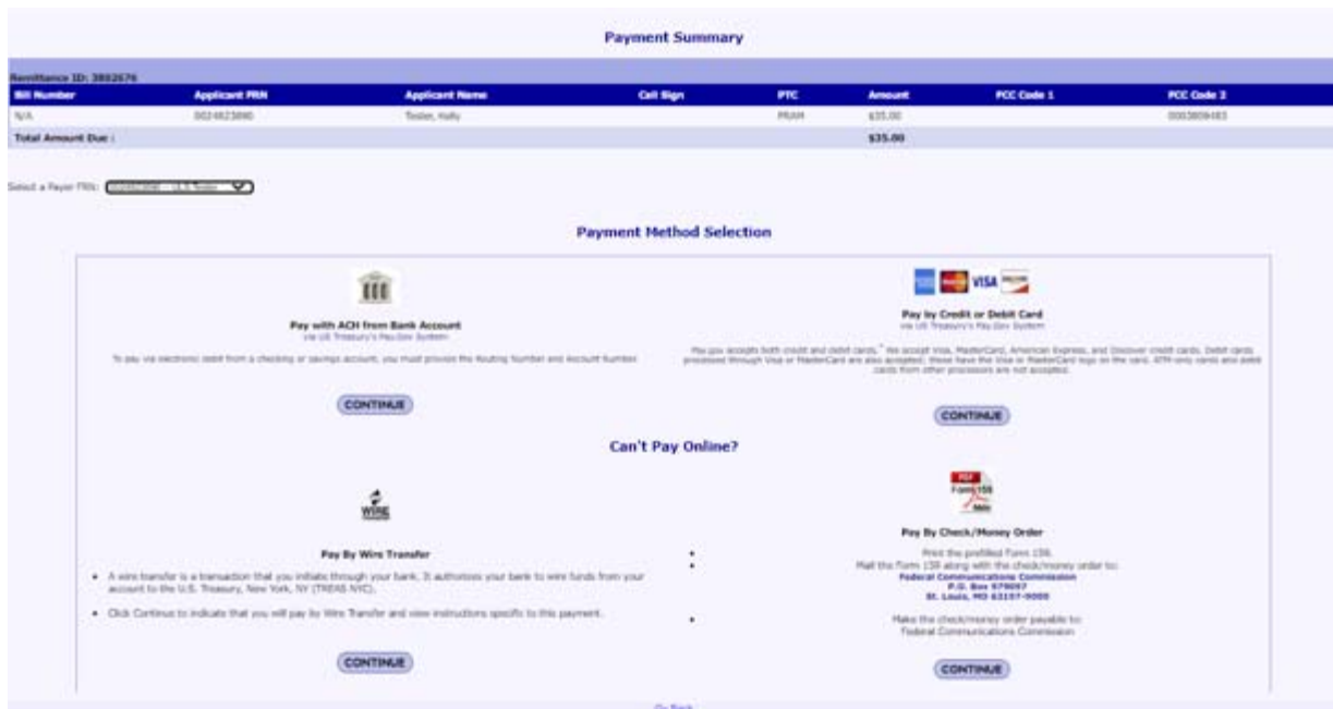
Figure 6: Payment Summary

Select the “Payer FRN” from the drop down box, and click “Continue” under the payment option you choose. Complete the payment.