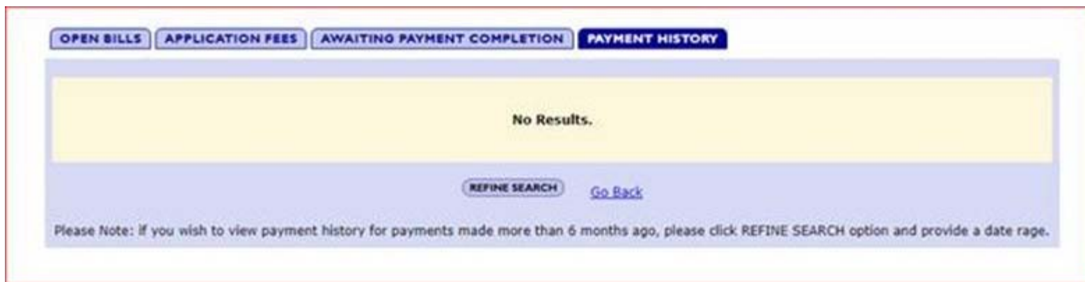
Figure 9: FRN Financial Tabs