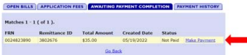
Figure 5: FRN Financial – Awaiting Payment Completion Tab

Once you select “Make Payment”, you’ll be taken to Payment Summary Screen: (see Figure 6). You will be given 4 options to make payment on the File Number(s) selected: