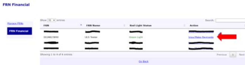
Figure 4: FRN Financial

*Note: If you have multiple FRN’s associated to your Username, they will all be listed here.