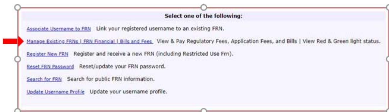
Figure 2: CORES Main Menu

The CORES main menu displays after users login with Username and Password, select “ Manage Existing FRNs | FRN Financial | Bills and Fees ”, (see Figure 2 )